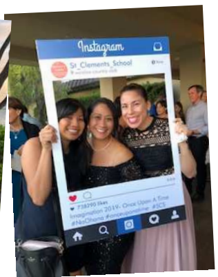
More photos online at : http://stclem.com/na-ohana